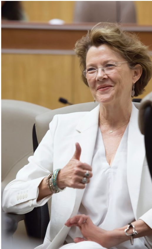
Annette Bening testifying in support of TADA! SB 916